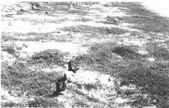
● Brown Boobies nesting on Bacchi Cay, 6 April 1986.

The surface of the cay is less than 2 m above high water and is susceptible to overwash and erosion by the sea during storms. It was completely inundated just prior to the July 1985 visit. There were no nests or live young present but there were 19 recently killed Masked Boobies and 20 recently killed Brown Boobies, most of which were juveniles or chicks.