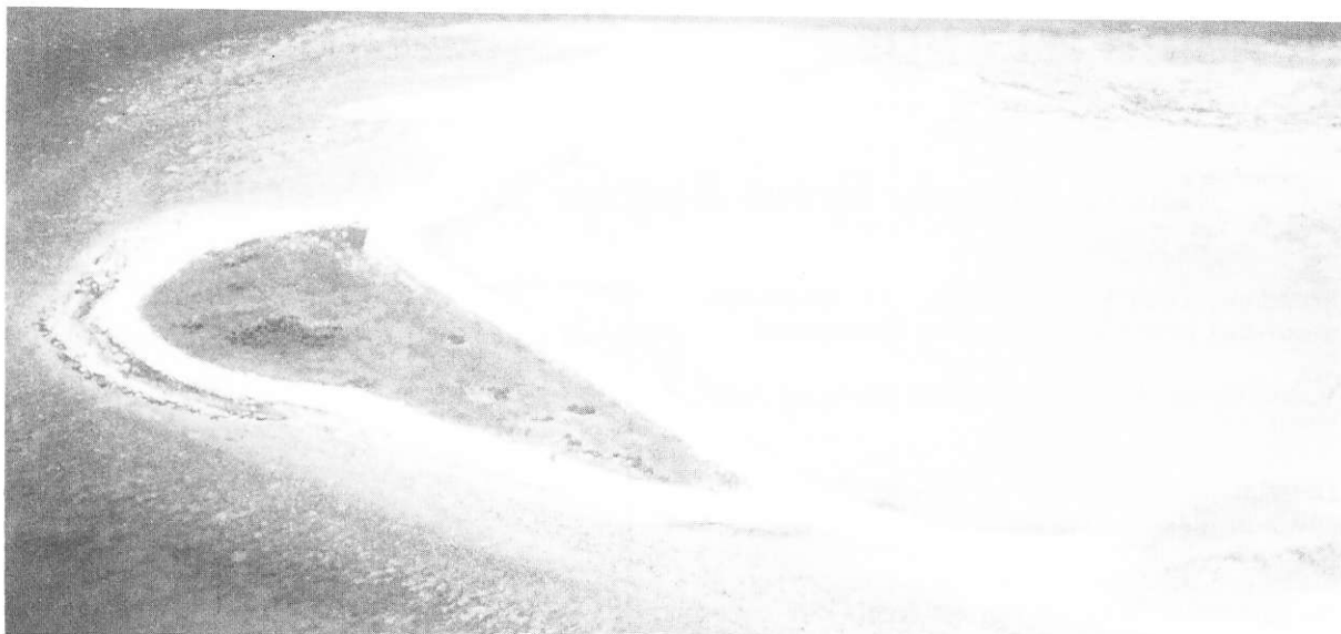
• Magra Island from the air (looking east).

Sterna dougallii Roseate Tern — In June 1981 there were over 400 adults present, with at least 100 juveniles. In addition there were over 200 recently-dead chicks and juveniles on the strand and in open areas of the grassflat. Nests are simple scrapes in the sand, and one or two eggs are laid.