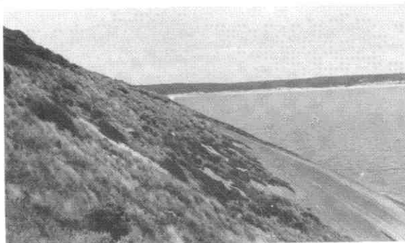
● Another view of the eastern side (looking north) with mainland in the background.