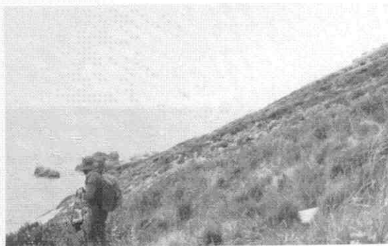
● Ben Island, eastern side (looking south).