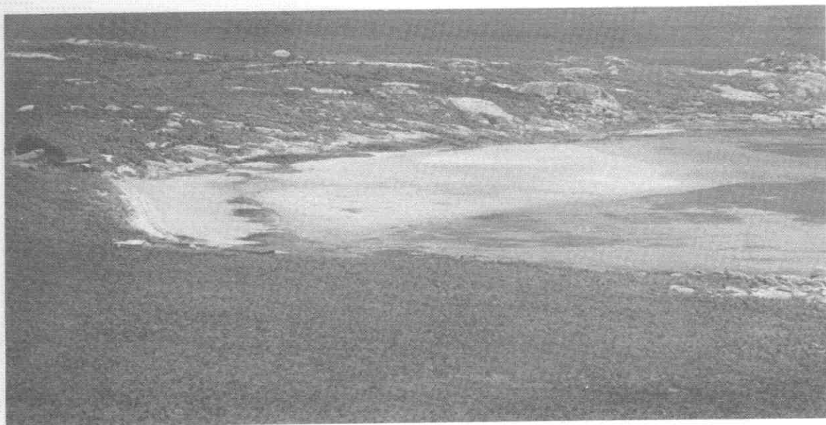
● Part of Great Dog Island (looking south-east); muttonbirders' huts are at left.