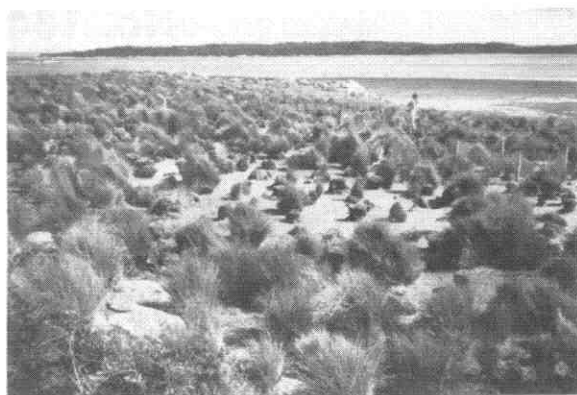
● Vegetation along part of the shoreline on Little Green Island (looking south). The northern end of Great Dog Island is in the background.