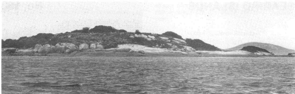
● Billy Goat Reefs (looking south-east).