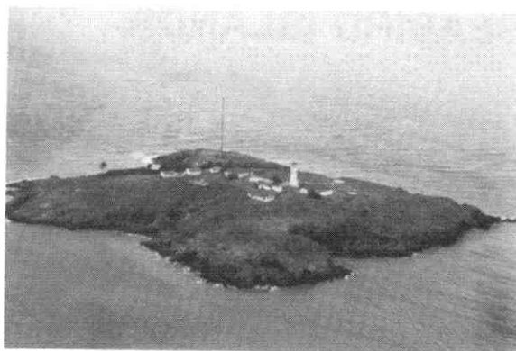
• Booby Island from the air (looking north-east).

Sterna anaethetus Bridled Tern — At least 50 breeding pairs nest on rock ledges or in rock clefts up to 1.5 m deep around the edges of the island. Egg size (mm; n=6) 45.7 \pm 2.1 \times 33.2 \pm 1.1 Clutch size: six nests had one egg; all 22 chicks were alone. These terns return to the island in August. An adult caught on 2 September 1984 had an egg in the abdomen. The same adult was caught on 27 November 1986 feeding an almost-fledged chick. In December chicks ranged from fully fledged to downy but no eggs were present. The last unfledged chick was caught on 24 January 1988. Presence of Bridled Terns is unusual after January; those banded in February 1987 were sheltering from a storm and were significantly lighter ( 108 \pm 9.7 g; n=27) than breeding birds caught in September 1984 ( 157 \pm 8.3 g; n=4) or