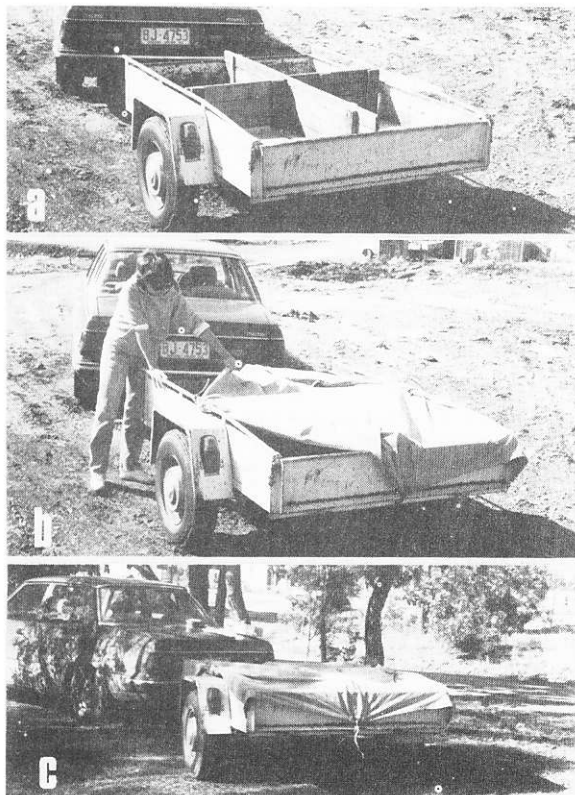
Figure 1. Photographs showing details of operation of holding trailer (a) tarpaulin removed to show the wooden boards which form the four compartments; (b) tarpaulin cover affixed to trailer with corner flaps open; (c) over trailer under shade for processing of birds.

The tray of the trailer is divided into four compartments with wooden boards (Figs. 1a and 2). This prevents the total catch of gulls from crowding into one corner. The floor of the trailer is lined with a thick layer of newspaper to absorb excreta and the trailer is covered with a tarpaulin, which is tied down with the tie ropes, 'A' (Fig. 2) to the front, back and sides of the trailer (Fig. 1b). The corner flaps 'B' (Fig. 2) are tied down when a compartment is full of birds. A very important feature of our trailer is that air is able to circulate through the compartments between the gap formed by the top of the sides of the trailer and the bar 'C' (Fig. 2), to which the tarpaulin is tied.