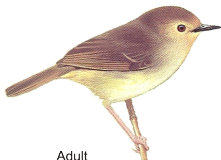
Adult S.m. magnirostra (central eastern Qld southerly to east Vic.)