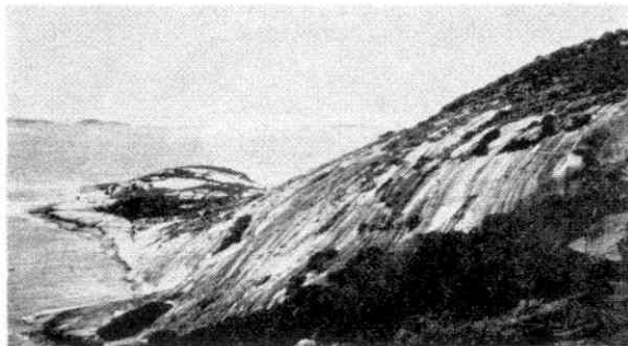
• The eastern tip from near the centre of the eastern side (looking south-east).