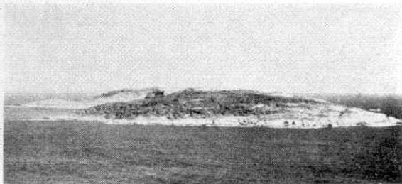
• Observatory Island (looking south).