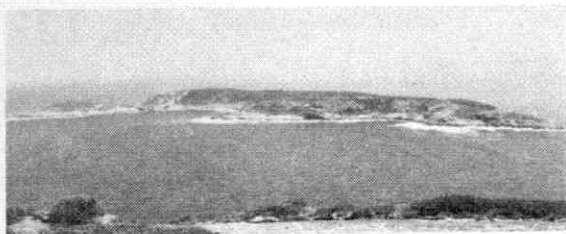
• Long Island (looking north-west).