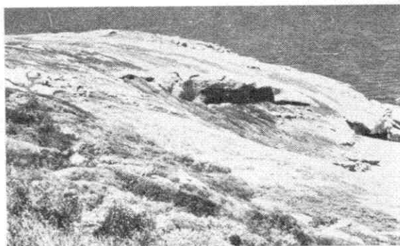
• The south-eastern corner; shearwater burrows were in the centre below the rock outcrop and along the grass shelf in the centre foreground.

information, unless otherwise indicated, was obtained on that visit.