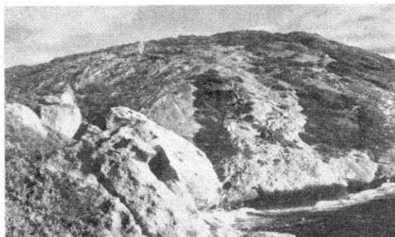
• Part of the north-western coast.