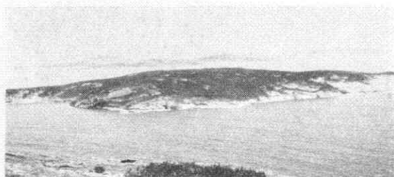
• Sandy Hook Island (looking north).