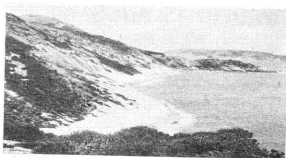
• Part of the north side (looking north-west). Long Island is in the background at right.

burrows each contained two birds and one was found in a third burrow. Numerous burrows were in the process of being dug and an estimate of "active" ones was between 500 and 1 000.