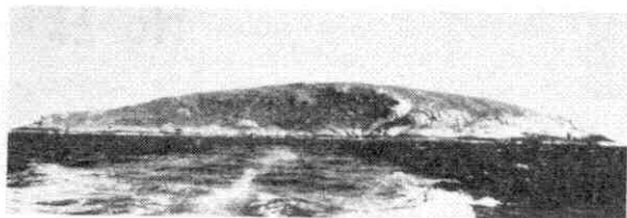
• MacKenzie Island (looking south-south-east).