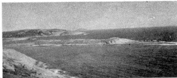
• Lorraine Island from the nearby mainland (looking south-south-east). Hammer Head is the large feature in the centre background at left.

Pelagodroma marina — 1 adult (2 Nov. 81).