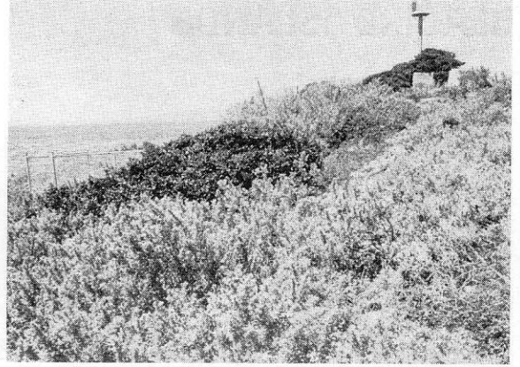
• Part of the storm-petrel colony (looking south-east).