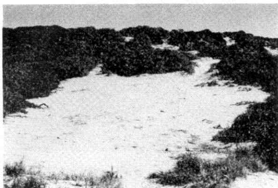
● Part of the storm-petrel breeding area.

grit and pigface in the centre of the island. By 25 January 1975 the eggs had hatched, and a runner was found. On 27 January 1975 a third pair began sitting on a single egg.