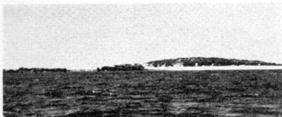
● North Fisherman Island (looking west).

Landing: Small boats can reach the eastern sandy beach via two small channels through the reef.