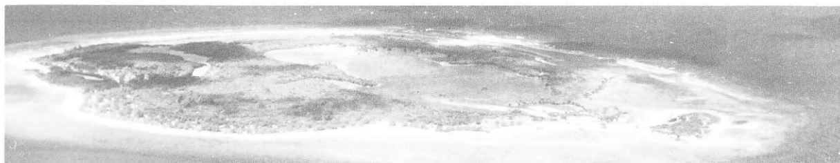
● Nymph Island from the air (looking south-east).

Sterna anaethetus Bridled Tern — Present on surveys on 18 November 1983 (106 adults), 20 December 1983 (nesting prolifically on the outer margin of the cay; eggs present), 5 January 1984 (74 adults; breeding), 9 February 1984 (70 adults; breeding), 10 February 1985 (18 adults) and 28 November 1985. Walker counted about 200 adults on 19 December 1989, but only one egg was found. Less than 50 birds were noted nesting on 16 January 1992; chicks were present.