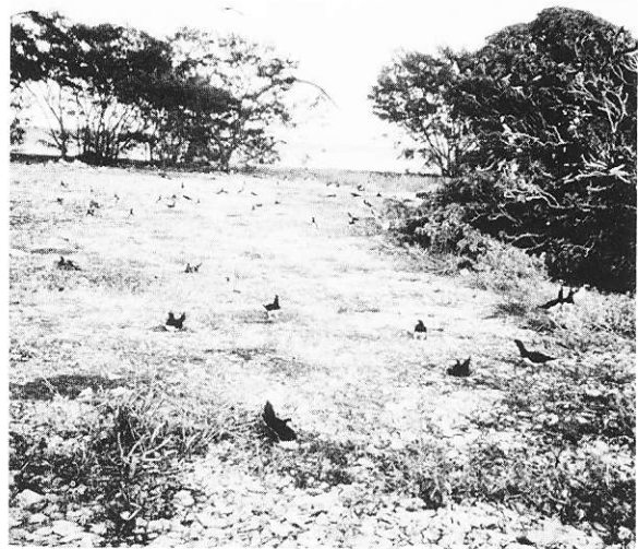
● Brown Boobies nesting on East Fairfax Island (western end).

Anous minutus Black Noddy — Nesting was recorded in November 1927 11,12 and in summer in 1966–70 1 . In January 1983 there were an estimated 670 birds nesting on both islands 8 . In December 1990 the eastern cay had 2 100 pairs nesting in Pisonia trees with probably a larger population on the western cay. Few birds are present during winter and the main population arrives to breed in August–September each year.