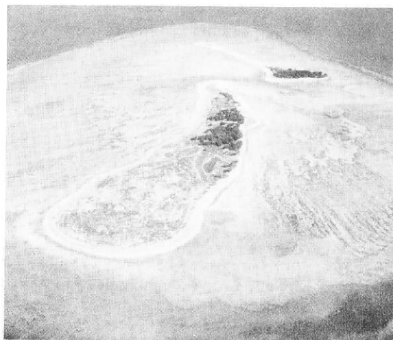
● Fairfax Islands from the air (looking west).

Sterna sumatrana Black-naped Tern — Nesting was reported in December 1937 6 and in the period 1966 to 1970 in November or April 1 . Thirty pairs