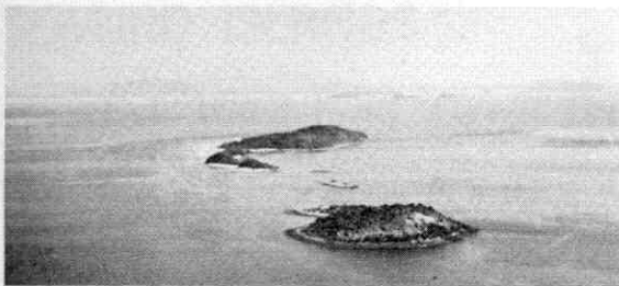
• Brook Islands (looking north-west).