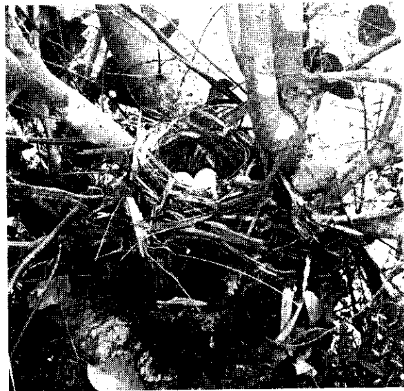
• Nest and eggs of the Grey Shrike-Thrush.