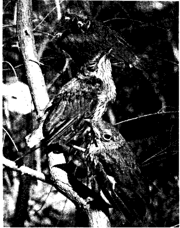
• Juvenile ( fledgling ) Grey Shrike-Thrushes.

Female: Lores grey; white eye ring; slight streaks from the chin to the upper breast. Separated from second year males by the white eye ring, and from first year males by the absence of the juvenile rufous primary coverts.