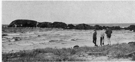
● Delicate Nobby (looking south-east from the beach).

None recorded. No doubt this is due only to lack of observations. Cormorants have been seen