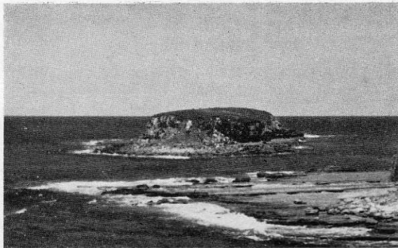
● Grasshopper Island (looking east).

G. M. Storr, Western Australian Museum, Perth, W.A.