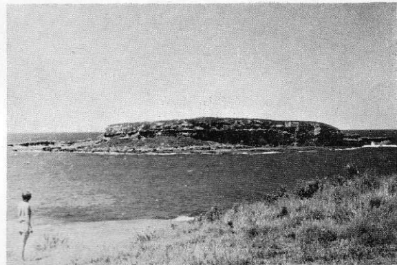
● Wasp Island (looking north-east).