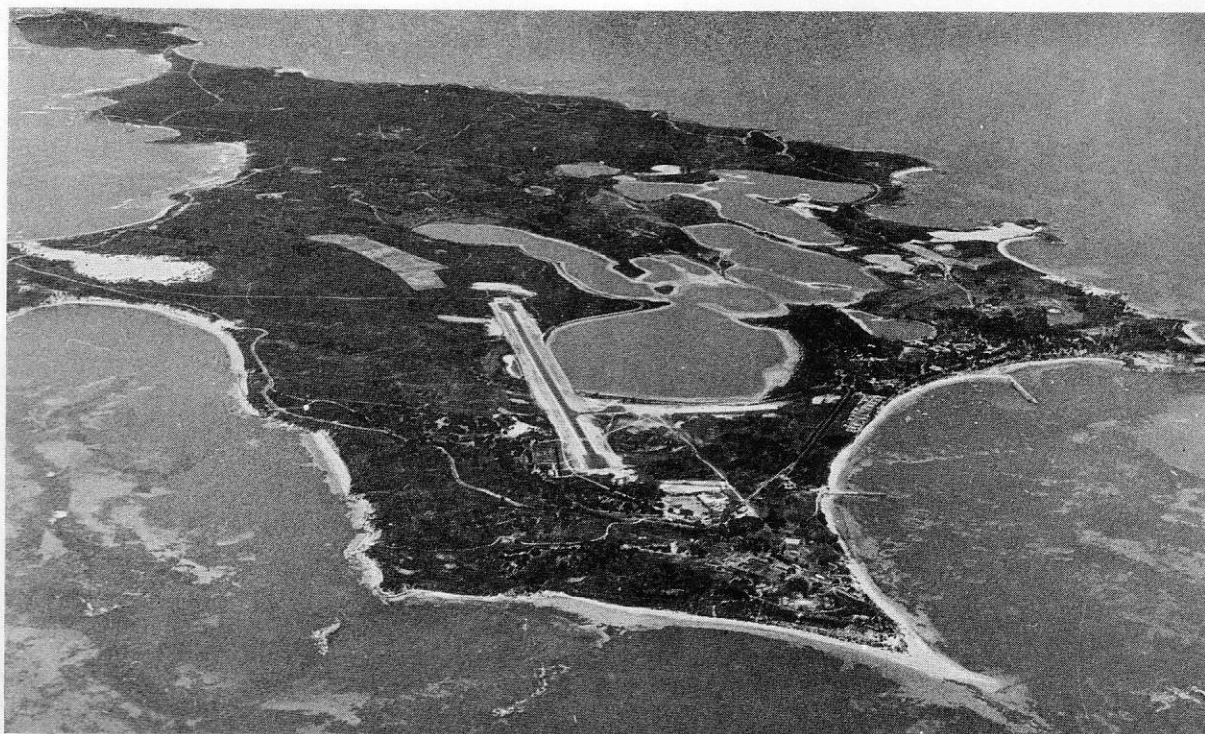
● Rottneest Island from the air (looking west-north-west).