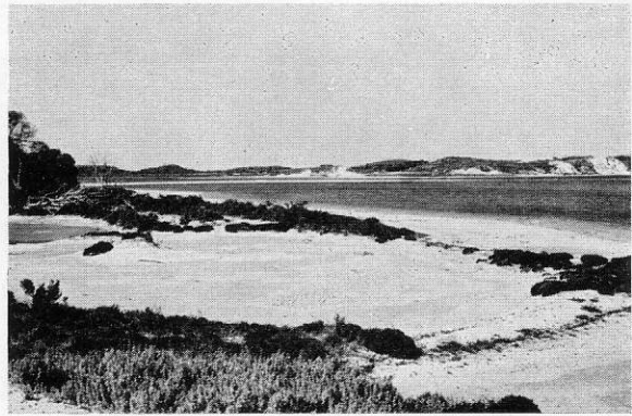
● Portion of Baghdad, the largest salt lake on Rottneest Island. A samphire community surrounds freshwater seepage at left.