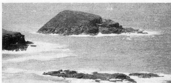
● Green Islet from Smoky Cape (looking north).

Probably rarely visited due to the difficulty of access from the adjacent rugged coastline. Crows Corvus orru were present and obviously take many eggs. Those eggs on the surface had been broken and eaten, and four had been carried to a rock outcrop.