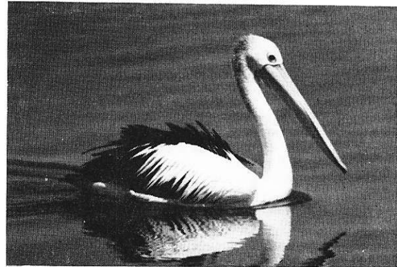
● Australian Pelican.