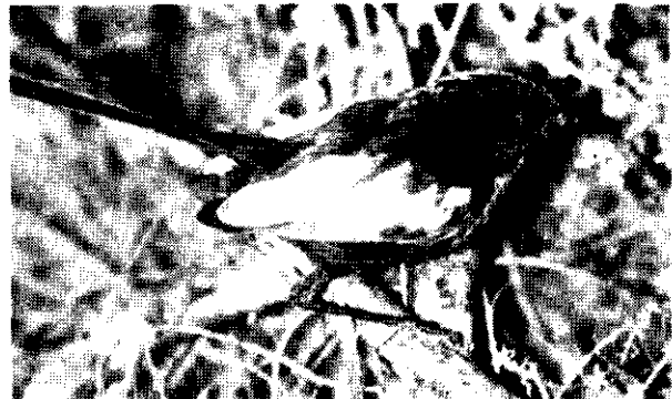
• Blue-and-White Wren