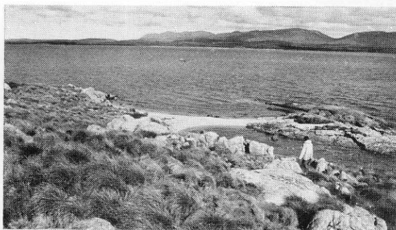
● Another view showing the south-west corner.