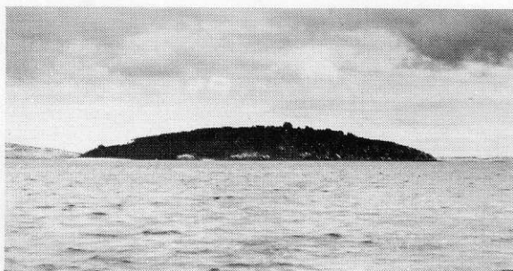
● Benison Island (looking south-west).