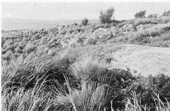
● Part of the northern side (looking east).