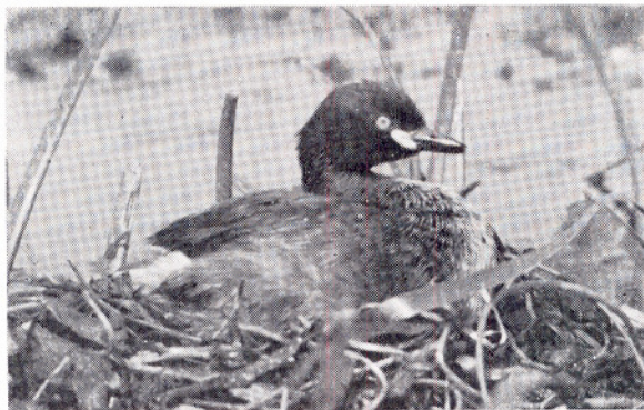
• Little Grebe on nest.