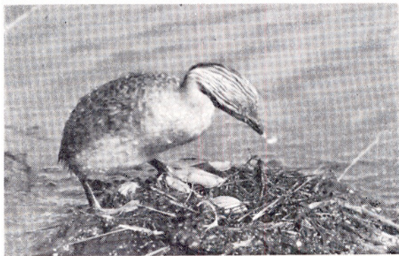
• Hoary-headed Grebe at nest.