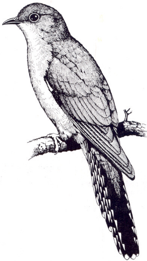
Drawing by W. T. Cooper