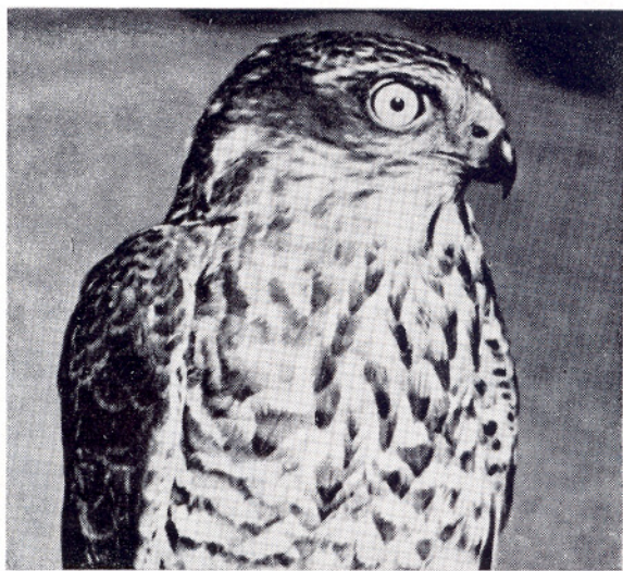
• Collared Sparrowhawk (immature female).