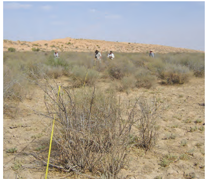
Figure 5. Site 12 near Koonchera Waterhole, Clifton Hills Station, sparser and lower lignum, possibly not recently inundated.