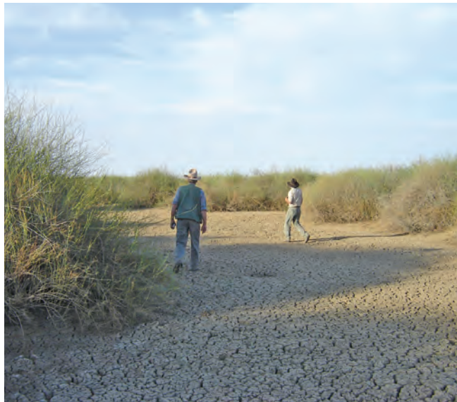
Figure 4. Site 7 at recently dry waterhole near Warburton anabranch, Cowarie Station, very tall dense Lignum.

Further study is required to determine to what extent habitat use across the floodplain changes during floods. Hardy (2002) made observations of Grey Grasswrens in an 11-hectare area of mostly tall dense Lignum in the Queensland section of Caryapundy Swamp on the Bulloo Floodplain during nine years between 1984 and 2000. He found their numbers to be greatest