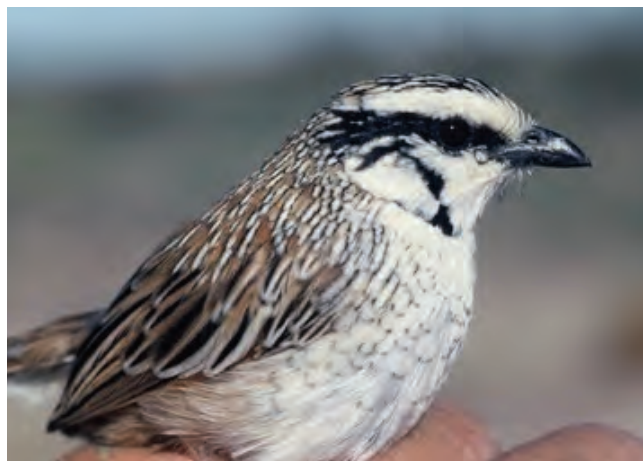
Figure 1. Grey Grasswren Amytornis barbatus diamantina hand-held at Goyder Lagoon.

apart in 1982 and again about a year later at Embarka Swamp on the main branch of Cooper Creek west of Innamincka (May 1982 and Ian May, pers. comm.). Later visits to Embarka Swamp by other ornithologists failed to confirm this record (Reid 2000) but Grey Grasswrens were subsequently identified upstream in the Cooper Creek system near Ballera Gas Centre in south-west Queensland (Carpenter 2002). These sightings show that the species is present in a third inland river system, Cooper Creek, but the subspecific status of this population is not known.