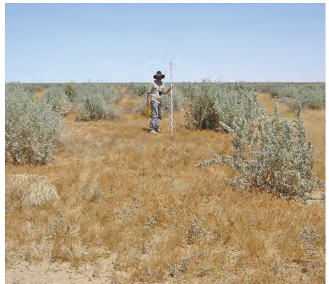
Figure 7. Site 1 on Warburton floodplain, Cowarie Station, open Old-man Saltbush shrubland.