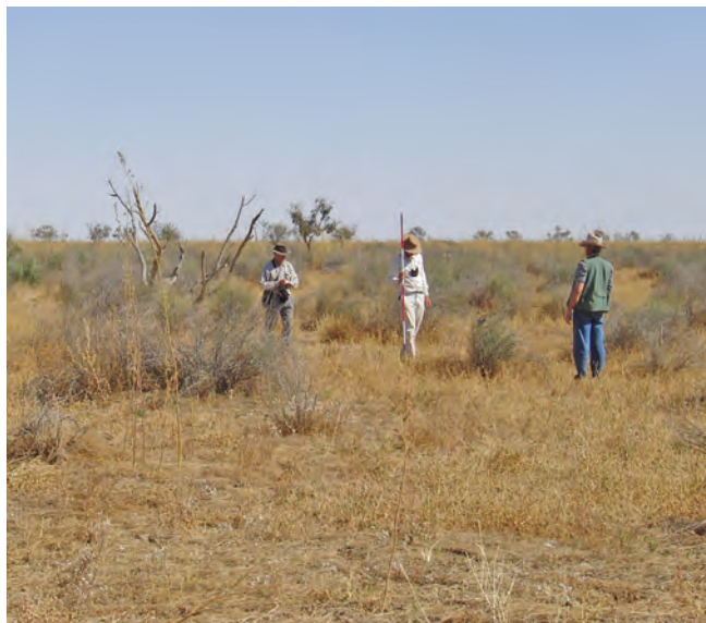
Figure 6. Site 8 on Warburton floodplain, Cowarie Station, recently inundated Lignum and Old-man Saltbush with emergent Coolibahs.