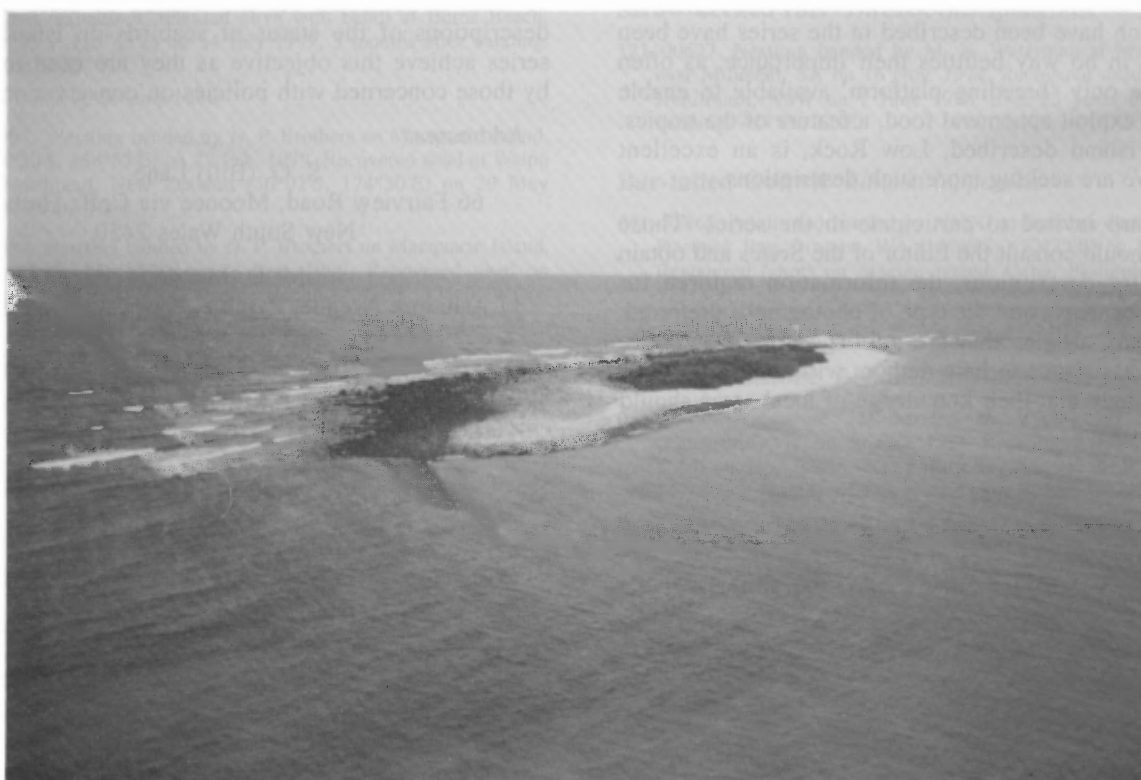
• Low Rock from the air (looking south-east).

Although landing by boat is not too difficult, the island's isolation and small size are unlikely to attract much