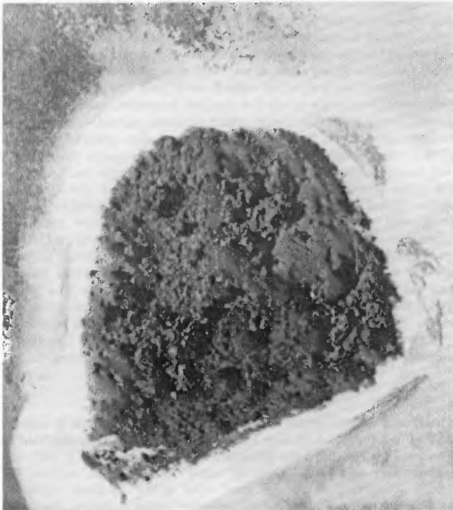
• Eastern Cay, Hope Island from the air.

Sterna sumatrana Black-naped Tern — In December 1994, a single flock of 65 adults were at the western cay; three nests (each with two eggs) and a downy chick were on a sand ridge at the edge of vegetation at the eastern side of the western cay. In both October 1987 and January 1992 there were only 1–2 adults present. The birds were absent in summer 1993.