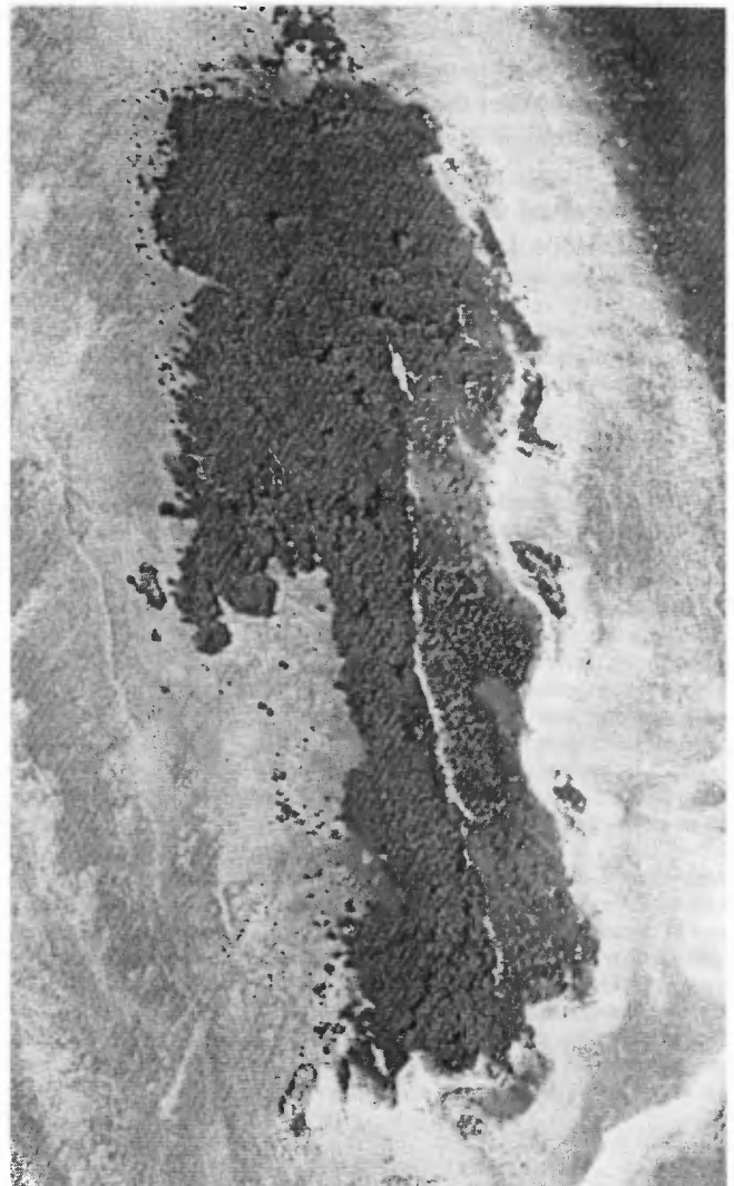
• Western Cay, Hope Island from the air.