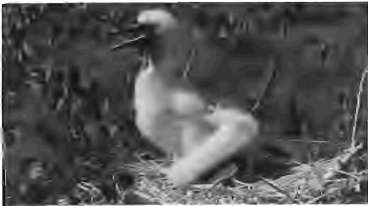
• Red-footed Booby chick on Adele Island (first photos ever taken in Western Australia).

Sula dactylatra Masked Booby — Recorded by Walker 11 on his visit in 1891, these birds are well established and mostly breed close to the shoreline along the western, southern and south-eastern end of the island. Some birds nest around the western and southern end of the lagoon and a few amongst Spinifex between the lagoon and the western side. Smith et al. 9 estimated about 100 pair on 18 June, 1972. Abbott 1 counted 177 nests on 4 June, 1978 and Moore 2 counted 320 nests between 19 July and 2 August, 1982.