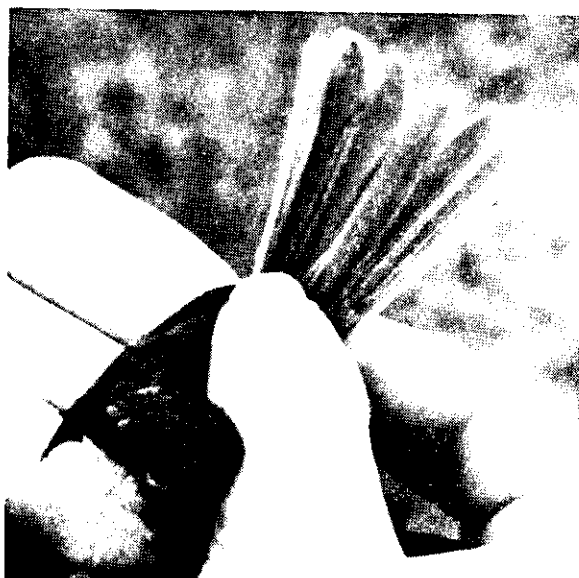
● Figure 1. Tail of female plumaged Leaden Flycatcher, Beerburrum, Queensland 28 November 1975.

In the late spring of 1975 mist netting commenced in the mangroves fringing Pumicestone Passage, situated 11 km east of Beerburrum. Pumicestone Passage is the waterway between Bribie Island and the adjacent mainland of south-eastern Queensland. During the summer of 1975-76 six Leaden Flycatchers in female plumage were netted in this area of mangroves. All six birds had a distinctive leaden-white margin on the external edge of the outer tail feather and the adjacent feathers were narrowly tipped white (Fig. 1). Other tail feathers may have a suggestion of a pale tip. Details of these six birds, together with another female netted in the same area in May 1976, are given in Table 2. Measurements and/or mass were taken for five of the six birds, and all were smaller than a pair netted