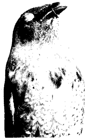
Older male, showing bill change and some blue feathers.