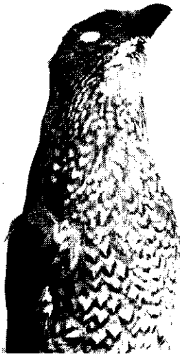
First year bird.