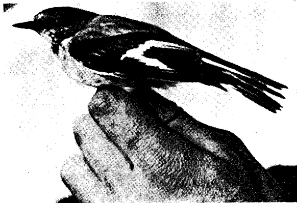
• Hooded Robin (female).