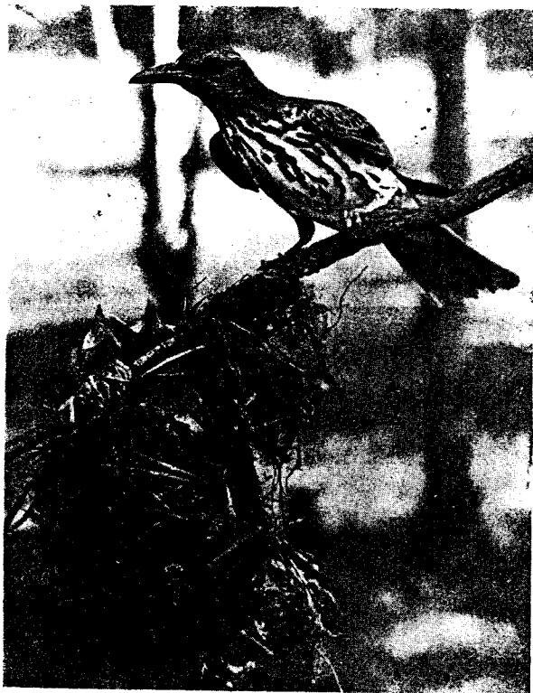
• Olive-backed Oriole.