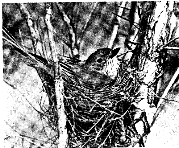
• Rufous Whistler.