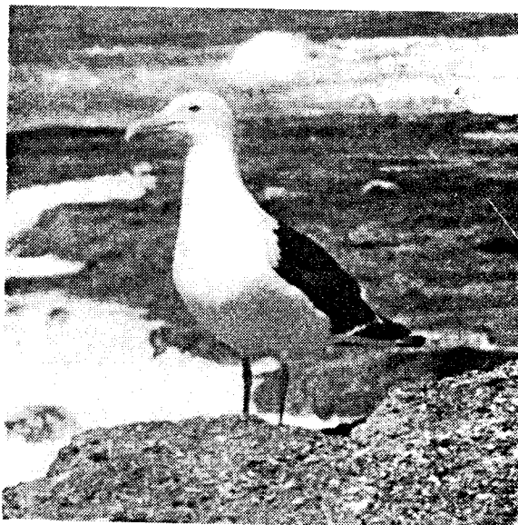
• Dominican Gull