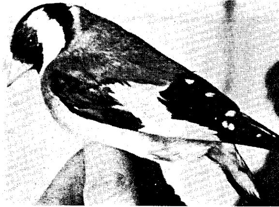
• Gold Finch.